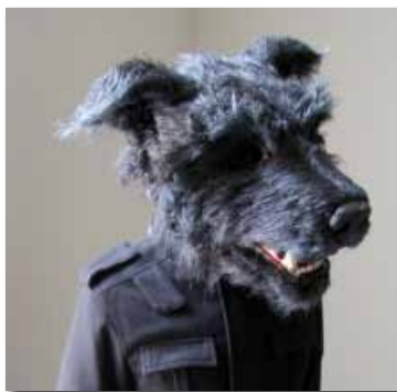
Jon Pryer The Dog (detail) 2009 cardboard, fibreglass dimensions variable