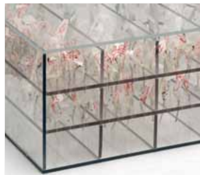
Corrie Wright in your dreams...the dress maker will draft a different pattern (detail) mixed poli-carbon plastic, paper, mono prints 220mm x 220mm x 140mm