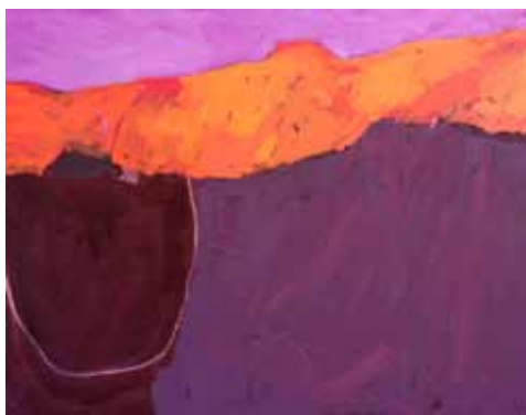
Barry Gazzard From Above 2009 oils and mixed media 84 x 107cm.