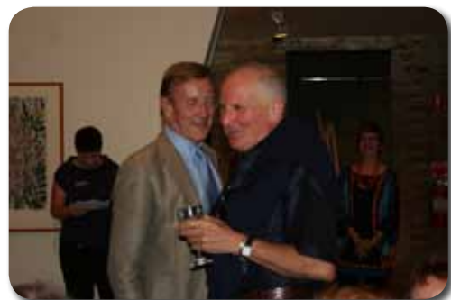
margaret olley addressing a crowd of 1500 at the new gallery opening edmund capon opening salvatore zoffrea’s exhibition edmund capon & salvatore zoffrea sharing a quiet word